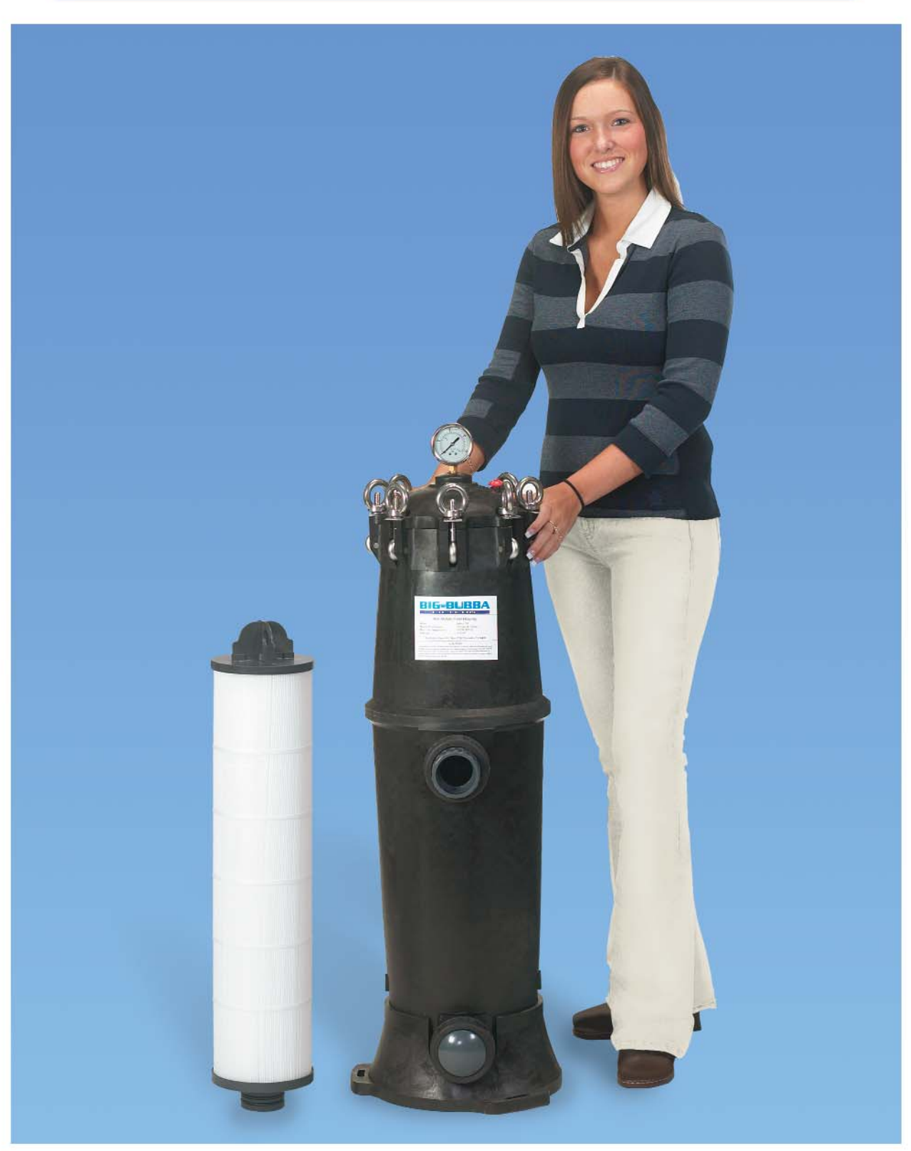
The economical alternative to high cost stainless steel.