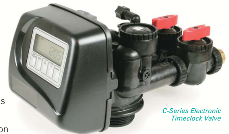
C-Series Electronic Timeclock Valve