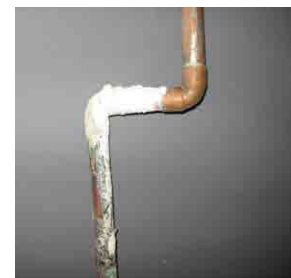
Hard scale build up on exterior of copper pipe in plumbing system.