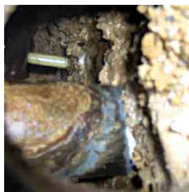
Large deposits of hard scale constrict water flow of this hotel plumbing system.