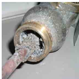
This temperature and pressure relief valve has become clogged with the accumulation of hard scale, which can lead to potentially dangerous conditions.